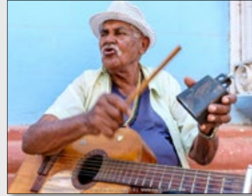
Feel the Rhythms of Cuba

After a little refreshing downtime, grab your camera as we head out to pass the gate into historic Barrio Chino (aka Chinatown), and explore the colorful streets. Dinner there and evening are free for personal exploration to enjoy Old Havana at night.